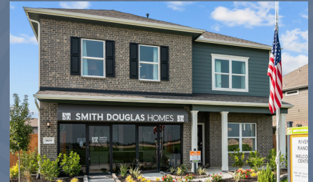
SMITH DOUGLAS HOMES